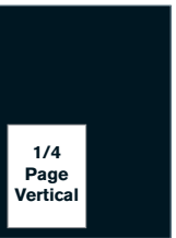
1/4 Page Vertical 3 1/2" x 4 1/4"