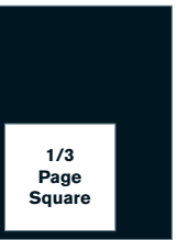
1/3 Page Square 4 1/2" x 4 1/4"