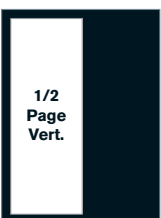
1/2 Page Vert. 3 1/2" x 9 1/4"