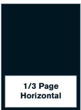
1/3 Page Horizontal 7 1/2" x 3 1/4"