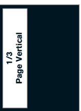
1/3 Page Vertical 2 1/2" x 9 1/4"