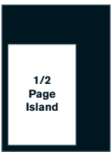
1/2 Page Island 4 1/2" x 7 1/4"