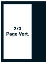
2/3 Page Vert. 4 1/2" x 9 1/4"