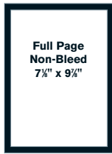
Full Page Non-Bleed 7" x 9 1/4"