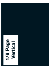
1/6 Page Vertical 2 1/2" x 4 1/4"