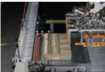
Layer handling is ideal for cases without sealed tops.

Side clamp tooling works well with thinner-walled sustainable packaging, and can offer flexibility for packaging lines that run a variety of products. For example, a small beverage line is able to clamp a six-pack differently than a three-pound box of syrup. However, this type may not be suitable for palletizing fragile items or for packaging materials with less tear strength than breach strength (think of a bowling ball in a plastic bag).