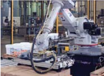
End-of-arm tooling is highly project-specific and represents a large percentage of the overall cost of a robotic palletizing system.