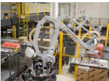
Today's manufacturers need to account for a wide range of packaging sizes, shapes and materials when designing robotic palletizing systems.