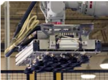
Ideal for traditional packaging such as sealed corrugate cases, vacuum tooling uses pneumatically actuated foam or cups (shown here) to lift products.

Vacuum tooling is ideal for sturdy, traditional packaging, such as sealed corrugate cases that can bear the total weight of the product during transfer. This method is not recommended for many types of packaging, including tall cases with a low center of gravity. As the robot accelerates, inertia can cause the cases to “peel away” from the vacuum carrying surface. If not planned for during the design phase, this issue can cause a lot of trouble when it is time to run production.