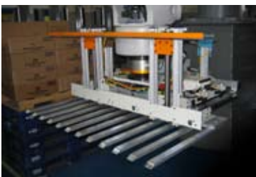
Fork style tooling is useful for handling irregularly shaped cases and bags and any packaging that cannot support its own product weight.

On the downside, fork style requires additional space for pattern formation. A large amount of mechanical motion makes this the slowest method, and it is not suitable for depalletizing.