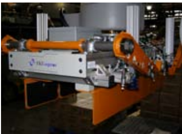
The multi-function side clamp tool shown here provides gentle clamping of cases, transfer of empty pallets and handling of slip sheets.

When clamps cannot transfer force to the center of the layer due to overpopulation of product or varying patterns, vacuum tooling can be used to hold the layer in place vertically. Vacuum-assisted layer handling is ideal for patterns that include voids for cooling purposes in pasteurization or heat-curing operations.