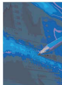
Packaging by the Numbers Version 2.0: Food and Beverage Packaging Published: July, 2006

Produced by: PACKAGING STRATEGIES www.packstrat.com Packaging by the Numbers Version 3.0: Package/Materials Recycling & Sustainable Packaging A Compendium of Global Statistics and Forecasts for the International Packaging Executive